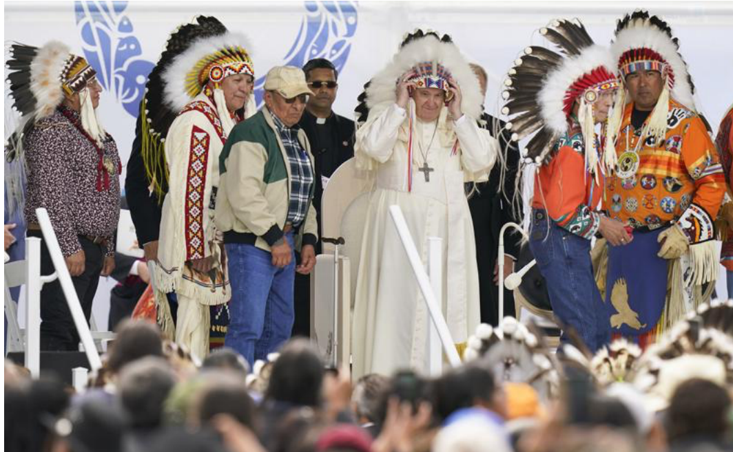
AP News – Pope in headdress stirs deep emotions in Indian Country