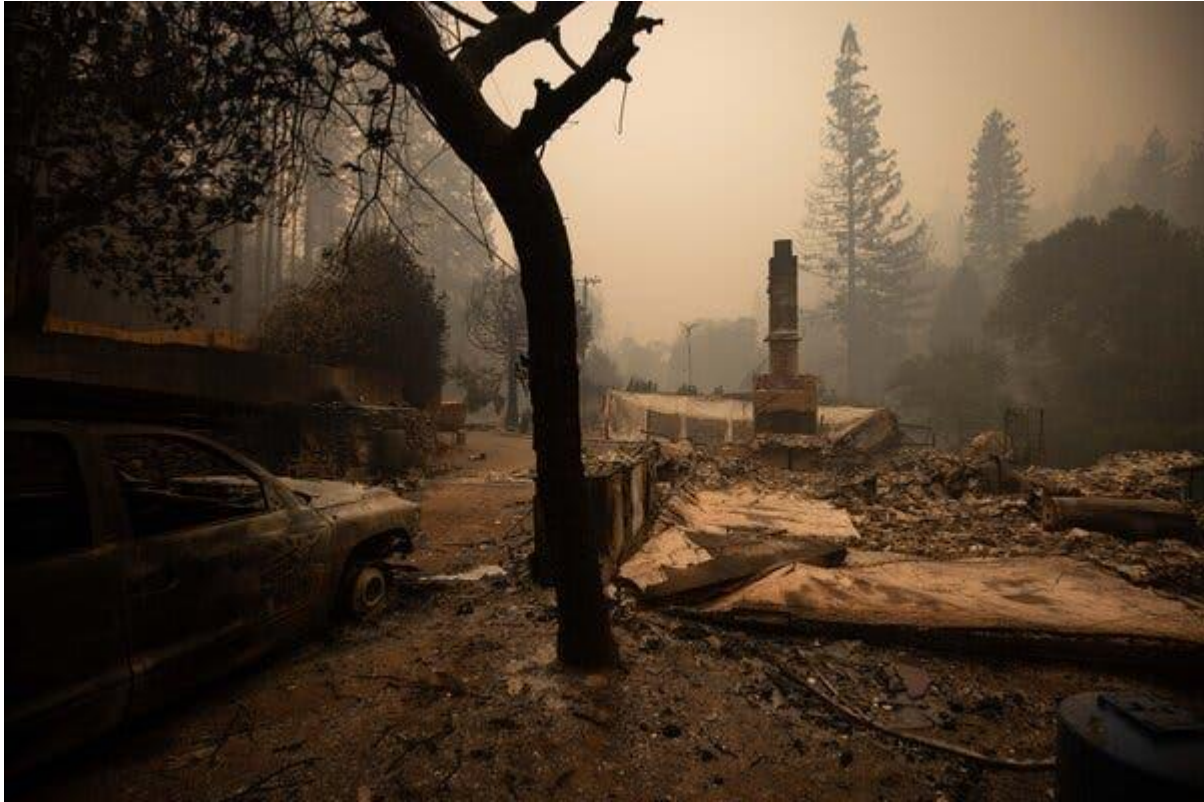
The remains of a home were surrounded by smoke after it was destroyed by the Bear Fire in Berry Creek, Calif.

New York Times - California, Oregon and Washington Fire and Air Quality Maps